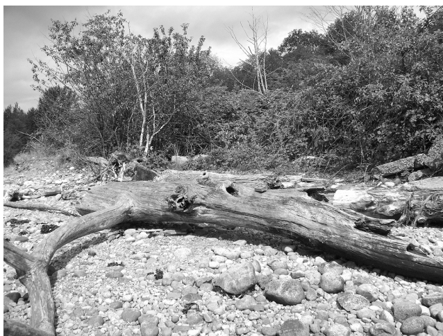
Figure 1. The tree trunk on which Red Crossbills (just left of centre) were observed feeding on salt. The trunk would have been repeatedly submerged throughout the preceding winter. Salt was left as a product of seawater evaporation. Maplewood Flats, 2007 August 08.

On 2007 August 08 at approximately 11:45 Pacific Standard Time, a group of Red Crossbills was observed gathering on a weathered tree trunk located in the upper intertidal zone