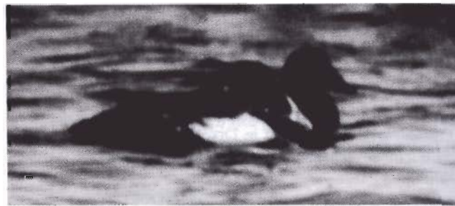
Reprint of: First winter male Common Eider among Surf Scoters, Kitsilano Beach, Vancouver 24 January 1997. Photo by Jo Ann MacKenzie published in B.C. Birds 7:14, 1997.