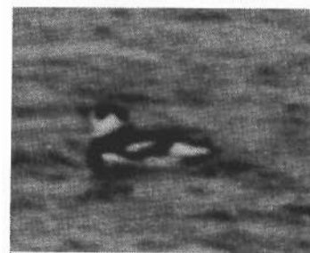
Figure 2. Kittlitz's Murrelet in outer harbour, Victoria, B.C. March 1986 (approximately one decade before the record documented in this report).

One, Skidegat Inlet, 8-9 November 1995, Peter Hamel (*), Charlotte Husband. A photograph of British Columbia's first record appears in Figure 2.