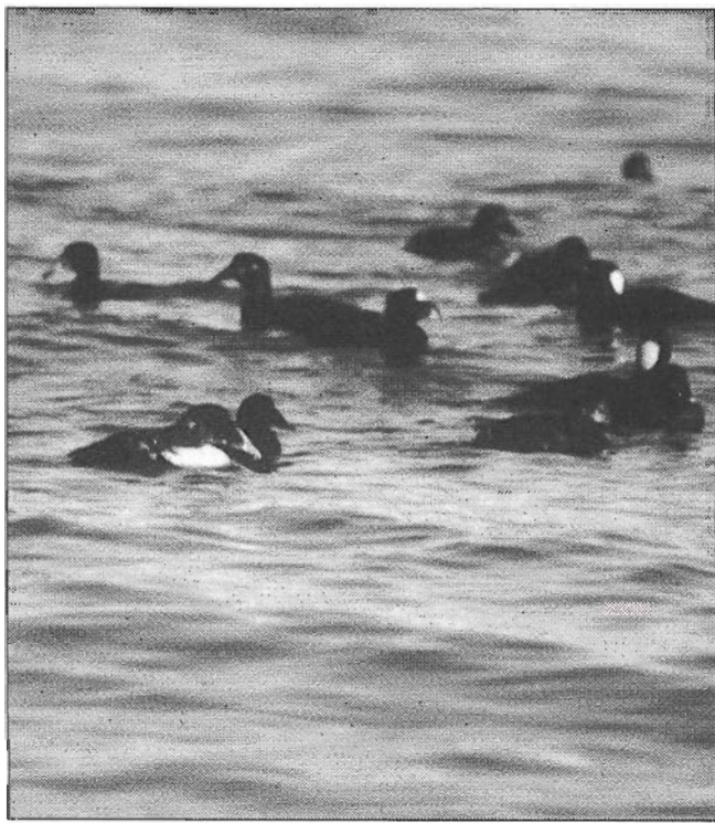
Figure 2. First winter male Common Eider among Surf Scoters, Kitsilano Beach, Vancouver 24 January 1997.